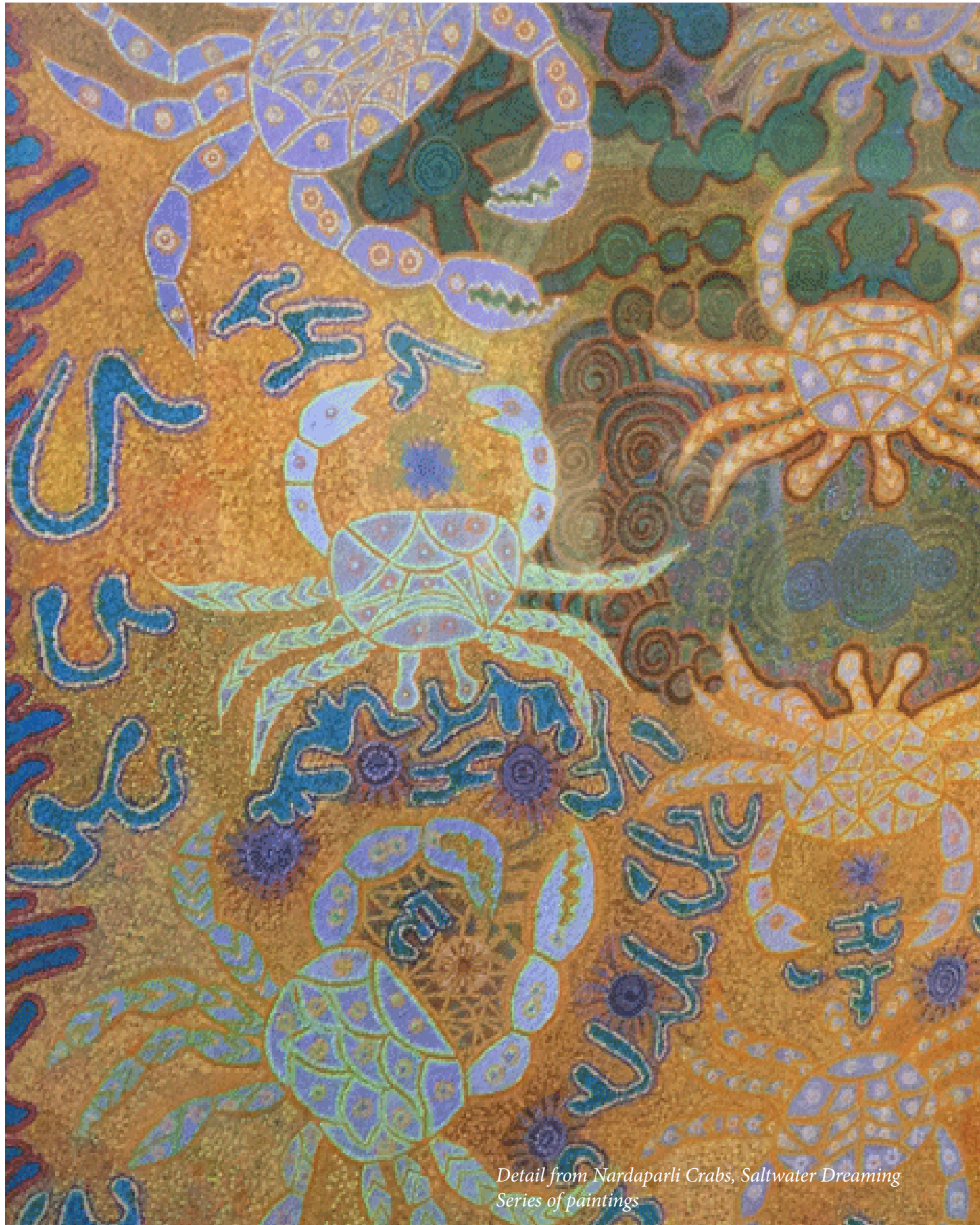
Detail from Nardaparli Crabs, Saltwater Dreaming Series of paintings

the community is intimately connected with the ocean. In a time honoured ritual families know the saltwater seasons and when salmon, mullet and tailor are starting to run. In years gone by the catch would be caught and then kept in the estuary nearby then gathered up and taken by horse and cart to Bomaderry Railway Station and then transported to the Sydney Fish markets. It was an extraordinary land based fishing community and the tradition still continues.